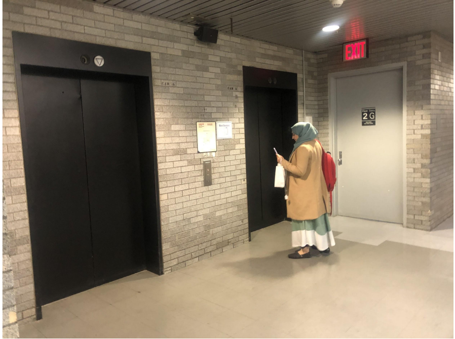
Busy elevators make students late

Students are expected to attend every class session of each course in which they are enrolled and to be on time. They should note that an instructor may treat lateness as equivalent to absence. No distinction is made between excused and unexcused absences.